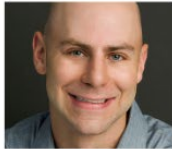
Adam Grant American Psychologist and Author