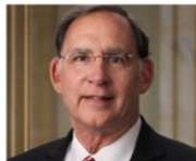
U.S. Senator John Boozman (R-AR)