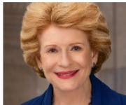
U.S. Senator Debbie Stabenow (D-MI)