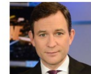
Dan Harris Award-Winning ABC News Anchor & Host of the Ten Percent Happier Podcast