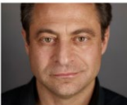
Peter Diamandis Chairman, Singularity University & Chairman and CEO | X PRIZE Foundation